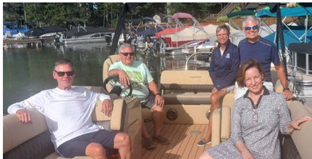
JULY: Most of you probably think Waupaca is Han Solo's buddy, but it is actually a pretty cool town in Wisconsin to hang out with siblings on the lake.