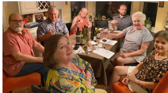
AUGUST: The Wineaux Group soldiers on, bravely sampling various vintages even in the face of a pandemic.