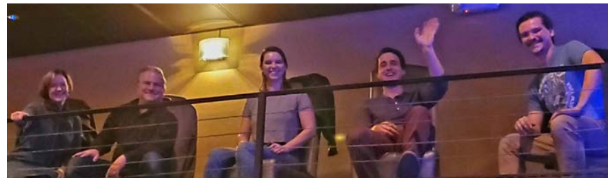
NOVEMBER: Seeing The Dip at the Kessler Theater.