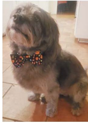
EVERY DAY: "I haven't had a treat in, ooh, at least five minutes now..."