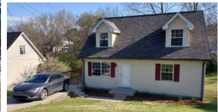
APRIL: The Years of Relocation continue, as we helped Dave move from Nashville's version of Uptown to a really hip neighborhood in East Nashville.