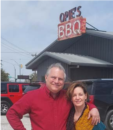
APRIL: On the way back from a weekend in Fredericksburg: you just can't beat Opie's!