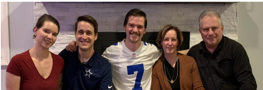
Thanksgiving: we really have so much to be thankful for.

We are really looking forward to 2023: Merry Christmas and Happy New Year to all!