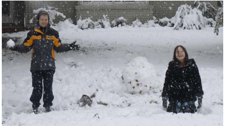
Taken in front of our house, believe it or not.