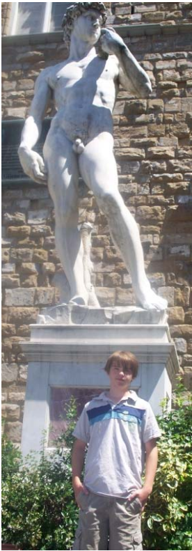
The World Famous David – and a statue

Florence was charming, and a wonderful place to wander around. After a couple of days of visiting the old haunts of Michelangelo and Leonardo, visiting the Duomo, several museums, the Bridge Over the River Kwai, and various pizzerias and bistros, we boarded another train and worked our way south.