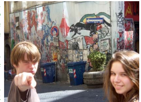
Some of Michelangelo's lesser-known work

From Paris, our trip to Florence was via a couple of sleeper berths in an overnight train, which was a novel experience for us and great fun. The countryside was very pretty, but it seemed that graffiti covered everything in sight that was man made, and some things that weren't. No wonder Europe leads the world in spray paint production.